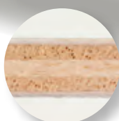
PERSSON - POWERPLAY - SENSO V1 / V2