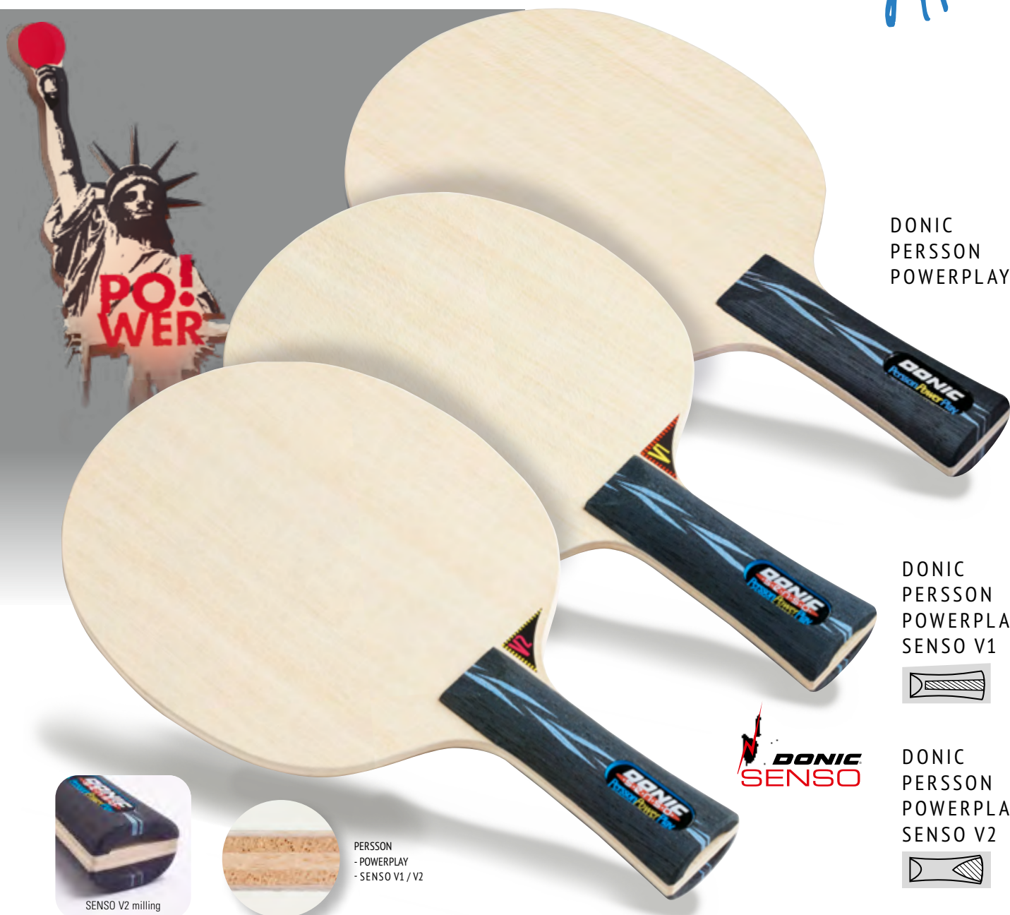
DONIC PERSSON POWERPLAY